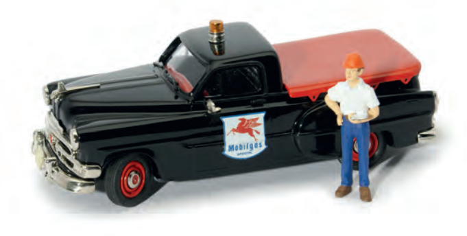
BRK31X - 015

This model represents a tow truck of San Francisco police department. The bottom of bucket consists of a plate steel cut at the correct size and painted matt black. The rims are repainted satin black like interior of the cockpit. Decoration consists of white decals SFPD on the doors with roof siren, searchlight and aerial. The crane is made entirely of whitemetal, it was molded by Tin Wizard, Germany. The police officer is amde by B.M. Toys.