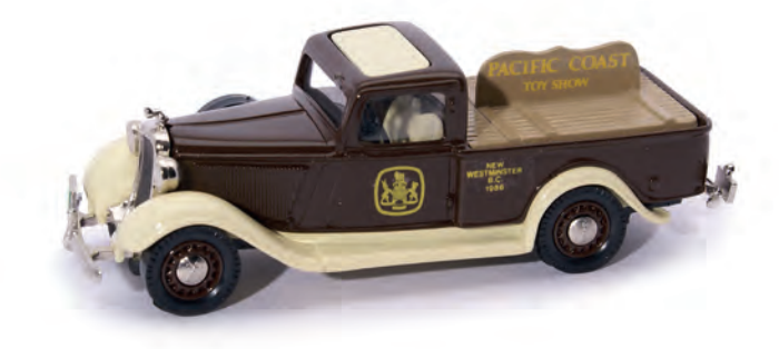
BRK16A - 005

For 1986 Ron Peters chose the 1935 Dodge Pick-up as a P.C.T.S. special, finished in brown with fenders, interior and roof panel in cream and a black radiator. A light brown signboard is found in the pick-up bed, with gold letters reading "Pacific Coast Toy Show". Lettering on the side of the bed reads "New Westminster B.C. 1986" and a gold crest is found on the doors. 150 Dodge Pick-ups were produced.