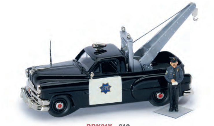
BRK31X - 018