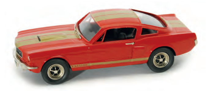
BRK124X - 001