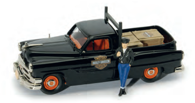
BRK31X - 016