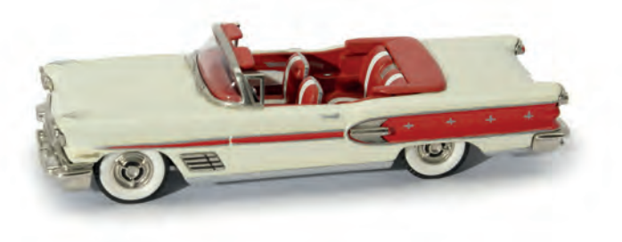
BRK25 - 004A

An interesting group of five Code 3's 1958 Pontiac Bonneville were detailed in USA in different colors in guantities which vary from 6 to 40. One is finished in cream with red rear fender inserts and red / white interior, another one is finished in red with white rear fender inserts and red / white interior. The remaining three have the original black color but with different rear fender inserts in pink, pistachio, lavender and matching color combination of the seats. It is not known who made these conversions.