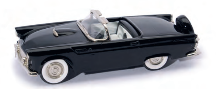
BRK13Y - 002

This model is part of the C.T.C.I. 40th Anniversary celebration set. The set consists of the 1955 Hardtop in Thunderbird blue (BRK13X), the 1956 Convertible finished in sunset coral, with black and white seats and interior, chrome gearshift, chrome windshield frame and yellow license plates and the 1957 Convertible (BRK13A) finished in azure blue. "Dearborn '94" is cast in base. See also BRK13X.