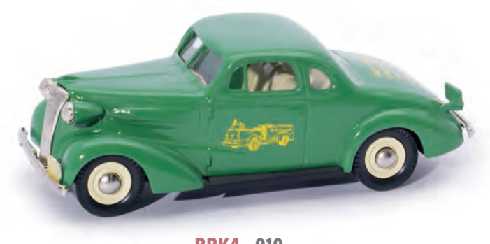
BRK4 - 010

This 1937 Chevrolet Coupe in apple green with light beige interior was done for the 1987 Toledo Toy Fair held in Maumee, Ohio. The words "1987 Toledo Collectors Toy Fair - Worth a trip from anywhere - Worldwide" are present on the trunk lid in yellow and the Old Toyland fire engine logo in yellow is found on the doors. 100 of these models were made.