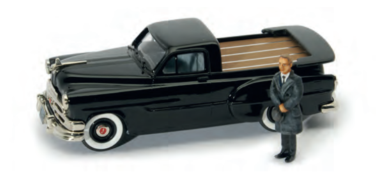
BRK31X - 017