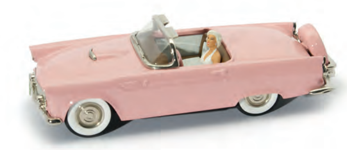
BRK13Y - 001

front edge of the trunk lid, allowing a variety of display possibilities. Just 250 Thunderbird sets were produced with a numbered certificate and were made available to club members only. Twenty-five figures in a red dress were sold at a B.C.D. meeting.