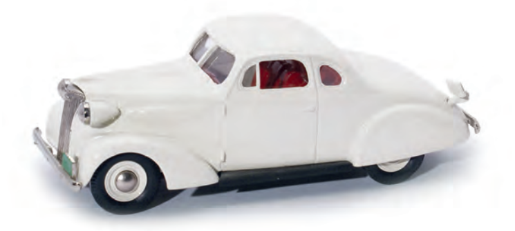
BRK4 - 012