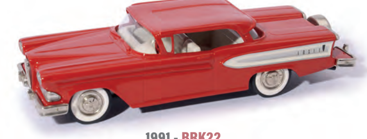
1991 - BRK22