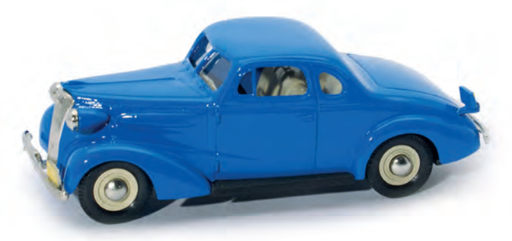
BRK4 - 011

A 1937 Chevrolet Coupe was chosen for the James Leake 15th Annual Automobile Auction held in 1987. Finished in gloss red, with beige interior and wheels and yellow license plates, the model features the auction logo in yellow on the doors. Just 150 pieces were produced.