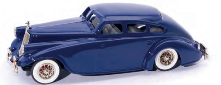
1992 - BRK1